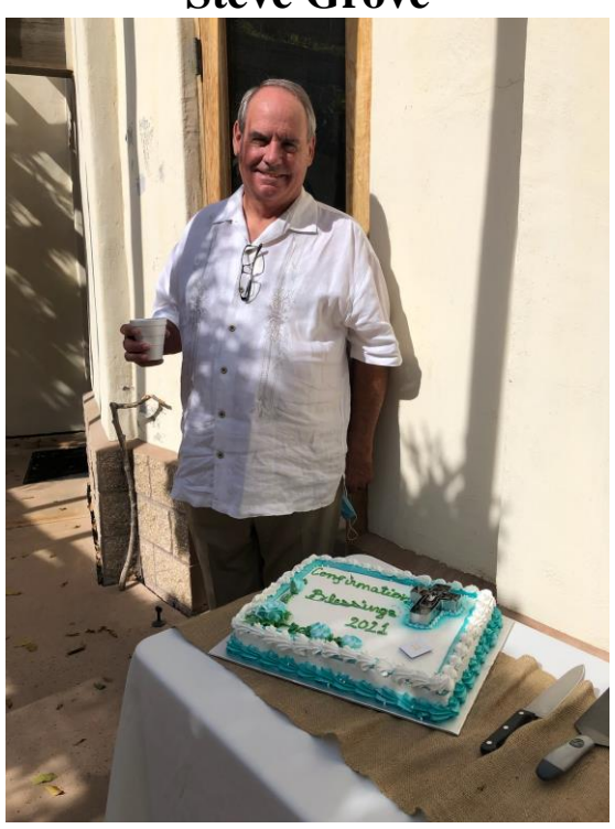
Welcome to the St. Francis Family